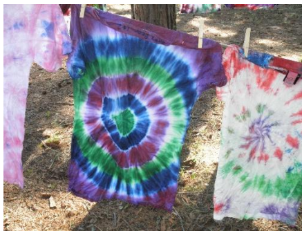
Tie Dye in Arts & Crafts