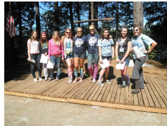
Cabin Awards & Closing Ceremonies