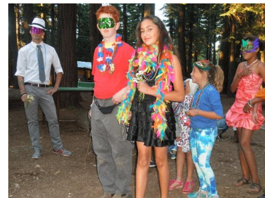
Dressed for the Friday Night Dance

An excellent kitchen staff provides three hot meals a day, which are appropriate for the individual with diabetes. Nutritious snacks are also provided at appropriate intervals throughout the day and evening. Food is an important part of diabetes management and we strive to help campers make healthy food choices.