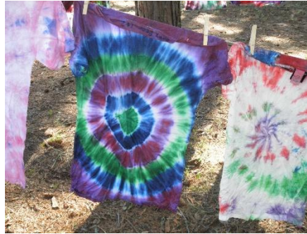
Tie Dye in Arts & Crafts