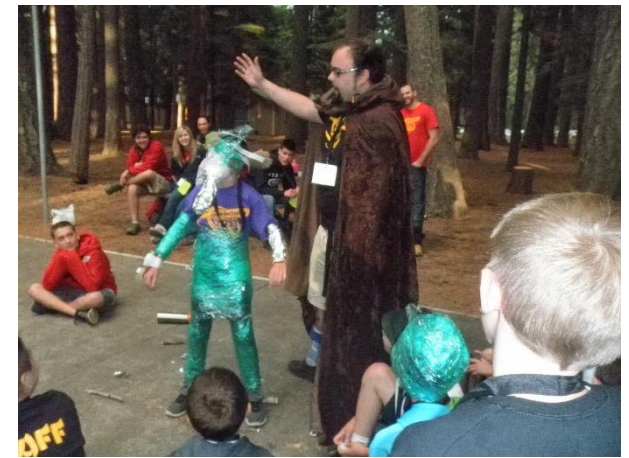
Star Wars Revisited Fun costuming contest with Saran Wrap!

The Ultimate Camp for the 8 - 15 Year-Old Child or Youth with Type One Diabetes June 22 through June 28, 2025