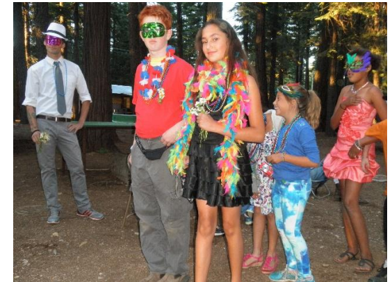
Dressed for the Friday Night Dance

An excellent kitchen staff provides three hot meals a day, which are appropriate for the individual with diabetes. Nutritious snacks are also provided at appropriate intervals throughout the day and evening. Food is an important part of diabetes management and we strive to help campers make healthy food choices.