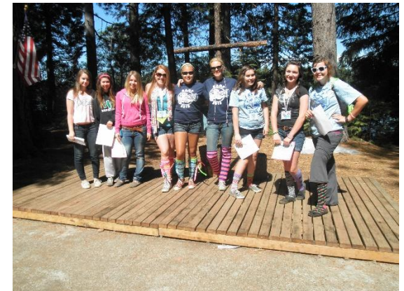
Cabin Awards & Closing Ceremonies